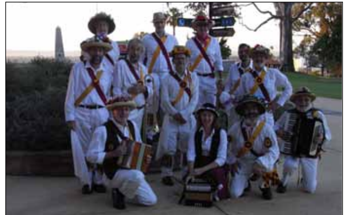
Fairbridge Festival coinciding with May Day.

The recent May Day was well attended at Kings Park with twelve of us in attendance (see also attached). In Perth's case we actually celebrated a couple of days later (May the 3rd) due to the